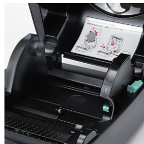
Rod-less label roll holder for easy loading and smooth feeding