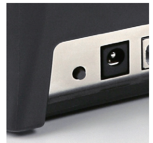
Innovative "C" button makes label Calibration simple and fast